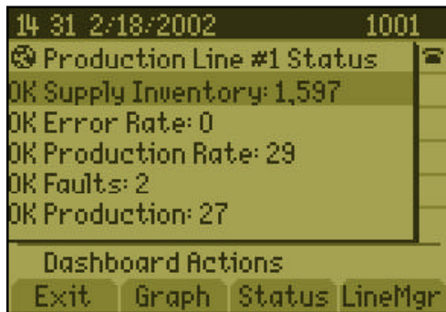
Status and QA information available on demand

With CTI Dashboard, your company can exploit its telecommunication investments to deliver critical data to the right people at the right time. CTI Dashboard provides a web-based console allowing authorized staff members to subscribe to critical information streams.