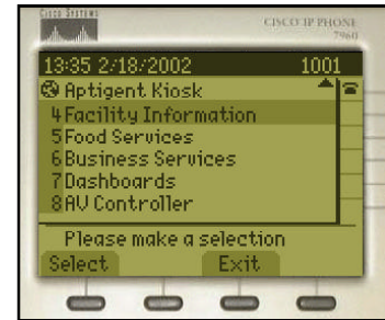
Information, advertising and storefront presentations

The CTI Kiosk is a practical solution to your information outreach needs, blending easy-to-use information resources with the convenience of a telephone.