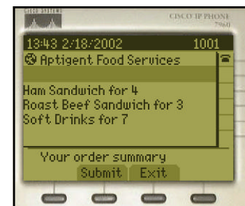
Automated web and IP Phone messaging

Visit us at www.apigent.com/iptelephony.shtml for more information.