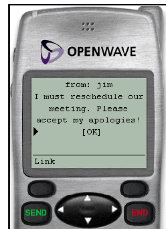
Text messages can be routed to cell phones too!

Visit us at www.apigent.com/iptelephony.shtml for more information.